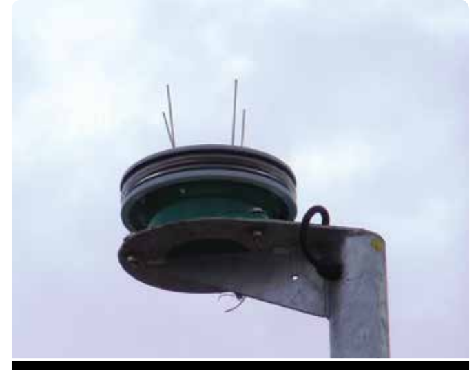
Vega VLB-44 - standalone LED light

For ranges of up to 4NM the Vega VLB-67 is available as a self contained unit (comprising power supply / solar panels and battery) or as a standalone light with an ac/dc power supply unit (with optional battery).