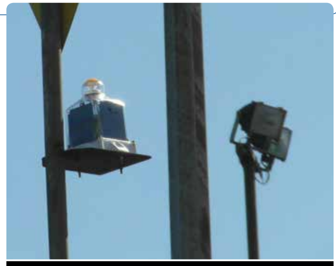
Vega VLB-2 - self contained LED light

A robust and maintenance-free self contained solar light with an expected working life of five to eight years. For ranges of 1.5NM fixed and 2NM flashing character.