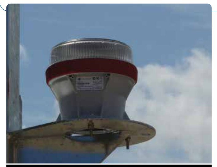
Carmanah M650 - self contained LED light

We offer a variety of IALA complaint LED lights for solar and mains power operation, which provide between 2NM and 10NM range. All lights exhibit all standard IALA flash characters and fulfil IMO regulations.