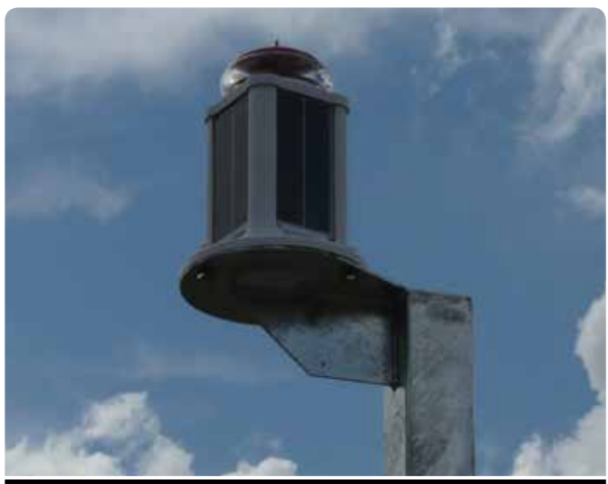
Vega VLB-67 - self contained or standalone light

A high capacity, maintenance-free, self contained solar light designed to provide 2NM range (fixed and flashing) particularly in high latitude applications.