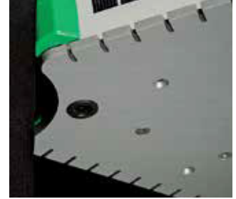
Installation The bottom plate of the SC 160 I supports installation on structures with 3 x M12 bolts on a 330 mm diameter.