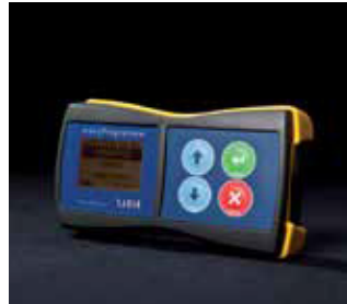
Sabik Easy Programmer User friendly and compact wireless two way programmer.