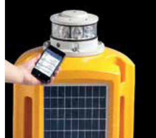
Bluetooth® Control Lantern can be programmed and battery status checked up to 50 meters distance with an app for Android and iOS.