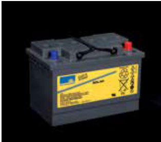
VRLA Battery Maintenance free lead acid battery with a designed lifetime of 7 years.