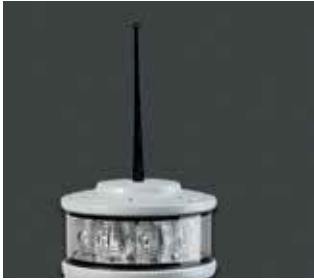
Bird spike Bird spike with thread to be installed in the center of the lantern top.