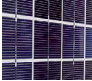
Solar Modules Solar modules with tempered glass front integrated in the PE-housing.