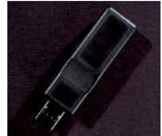
Programming with PC Using Sabik USB interface.