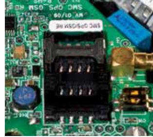
Remote monitoring GSM unit and antenna integrated in the lantern for remote monitoring and control. For more information, please see the LightGuard Section.