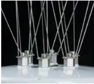
Bird spikes Stainless steel bird deterrents as standard. Easy to replace. Offers great protection.