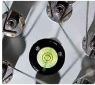
Level indicator The lantern can easily be levelled in field using the integrated bubble level indicator.