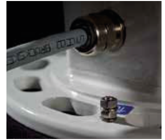
Grounding plug The base plate has a grounding plug as standard to enable good protection against electromagnetic interference.