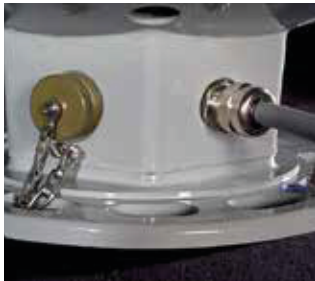
Additional cable entry Equipped as standard with two cable entries. If the second entry is needed e.g. for a solar module standard M20 cable gland can be fitted.