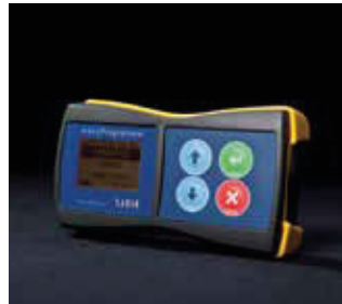
Sabik Easy Programmer User friendly and compact wireless two-way programmer.