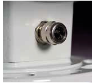
IR port and photocell Combined infrared communication port and photocell is located on the base of the lantern.