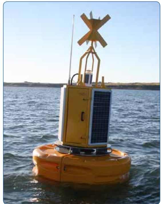
data buoy platforms

As all components are fabricated in jigs, replacement structures can be held at base allowing a buoy to be quickly reconfigured with a completely different sensor suite and/or data logging system.