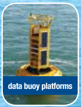
data buoy platforms